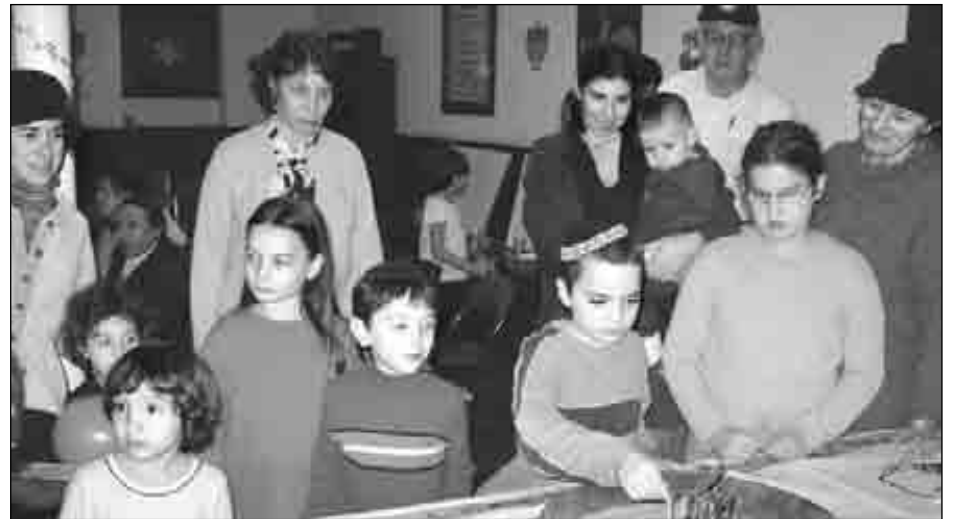
▶ Children's Menorah lighting at the Chanukah party

Congregation Agudas Achim Anshei Sfar 168 Adams Street, P.O. Box 600371 Newtonville, Massachusetts 02460