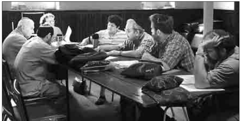
Executive Board Meeting, Summer 2004